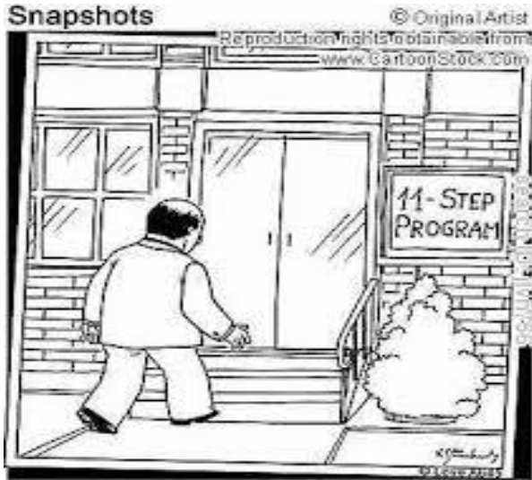
(For the habitually lazy.)